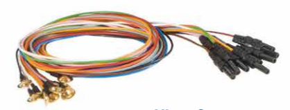
Ultra-Compact, Lightweight Recorder