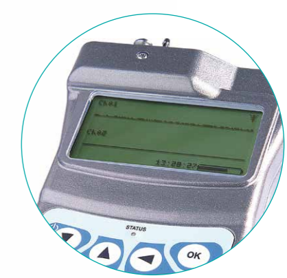
LCD display of signals and impedance