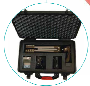
Space saving equipment storage inside