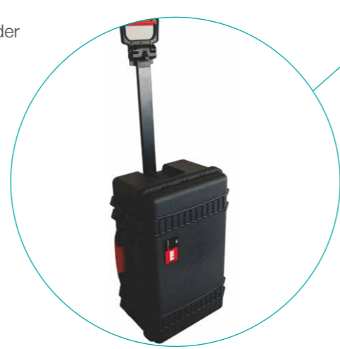
Rugged, durable case with wheels for easy transport